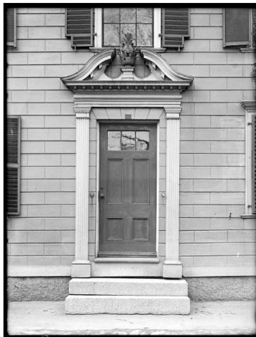
Above: The Captain Thomas Poynton House, 7 Brown Street Court, Salem, Massachusetts, aka "The Pineapple House", built circa 1740-1750. Left: Jelly Mold, Colonial Williamsburg, circa 1680.