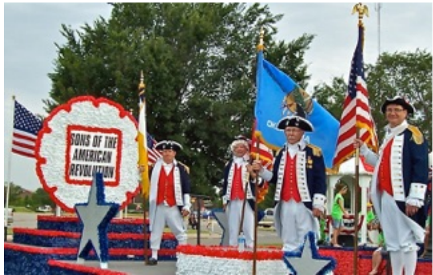
Above, OKC/SAR Color Guard members at the 4th of July Parade in Edmond, OK.